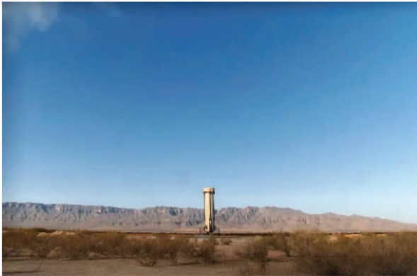
NS-27 after landing. This mission debuted the second human-rated vehicle for the New Shepard. [1]