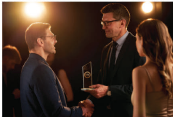
How Global Recognition Awards Is Shaping the Next Generation of Business Leaders

The Global Recognition Awards (GRA) has significantly influenced future business leadership where innovation and excellence are crucial.