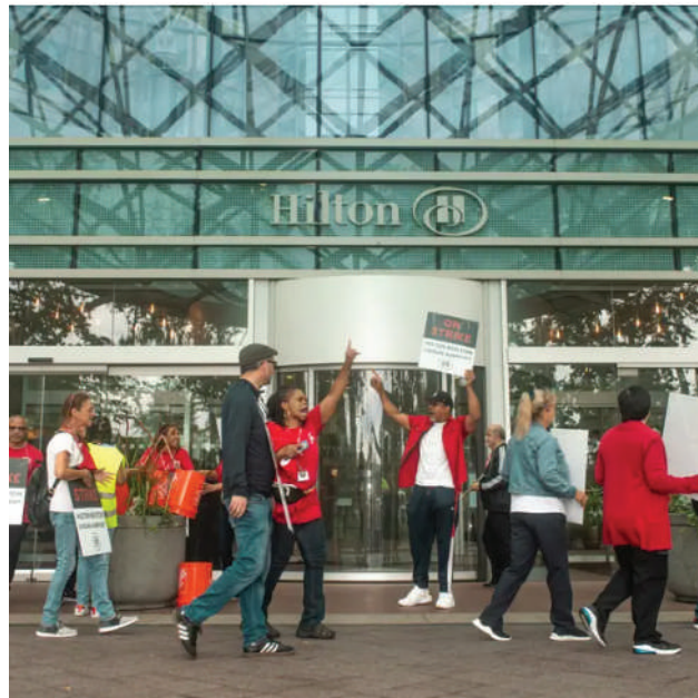
UNITE HERE members picketing outside the Hilton Boston Logan Airport on Sept. 1 after more than 10,000 hotel workers went on strike across the country over Labor Day weekend.

With hotel chains and union members locked in a dispute over wages and working conditions, strikes could continue to disrupt travel in major U.S. destinations. Here's what to know.