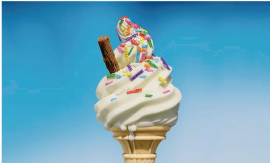
📷 Play it cool ... our summer arts preview is sprinkled with amazing ideas. Illustration: Thomas Burden/The Guardian

From female art trailblazers to playful performance fests, a ridiculous funk wannabe to a clubby Argentinian dance spectacular, our critics pick the arts events that will light up your summer