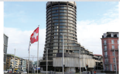
The tower of the headquarters of the Bank for International Settlements (BIS) is seen in Basel, Switzerland.

The tower of the headquar- ters of the Bank for International Settlements (BIS) is seen in Basel, Switzerland.