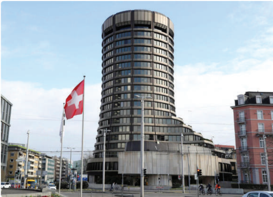
The tower of the headquarters of the Bank for International Settlements (BIS) is seen in Basel, Switzerland.

The threat of soaring government debt supply destabilising financial markets has intensified, the world's top central banking advisory body said, as it urged policymakers to act swiftly to prevent economic damage.