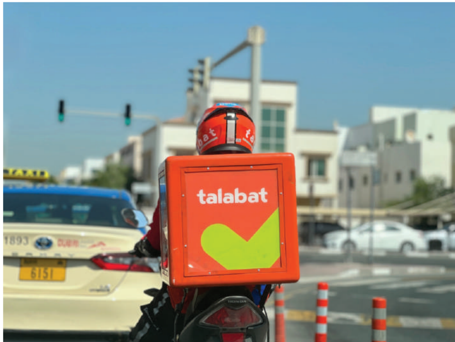
Talabat's share offering implies a market capitalization of $10.1 billion (AED 37.3 billion) on the listing, which is expected on December 10.

By James Emmanuel Forbes Middle East Staff Nov 29, 2024, 16:55 PM