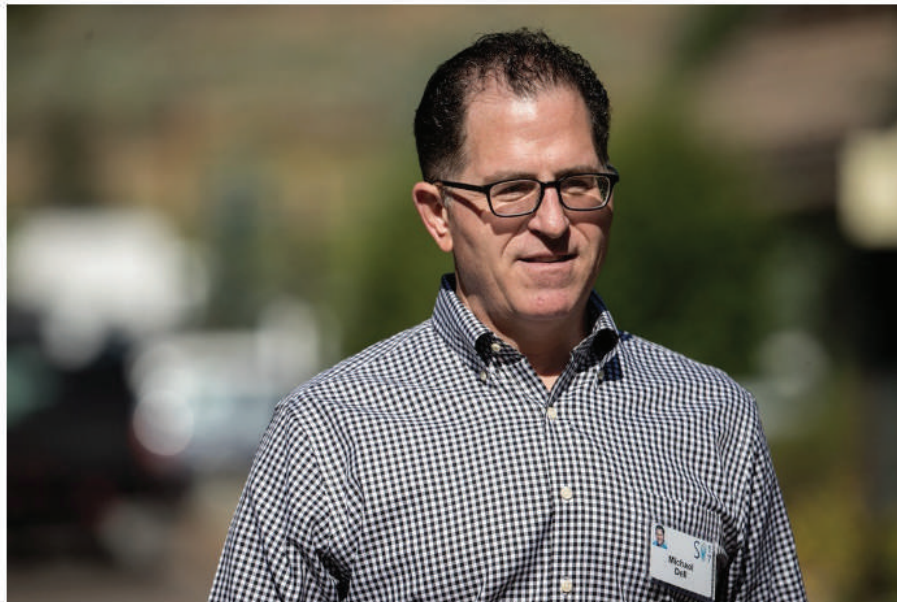
Michael Dell's net worth surpasses that of fashion retailer Amancio Ortega, Nvidia co-founder Jensen Huang, Walmart's Rob and Jim Walton and Bill Gates.